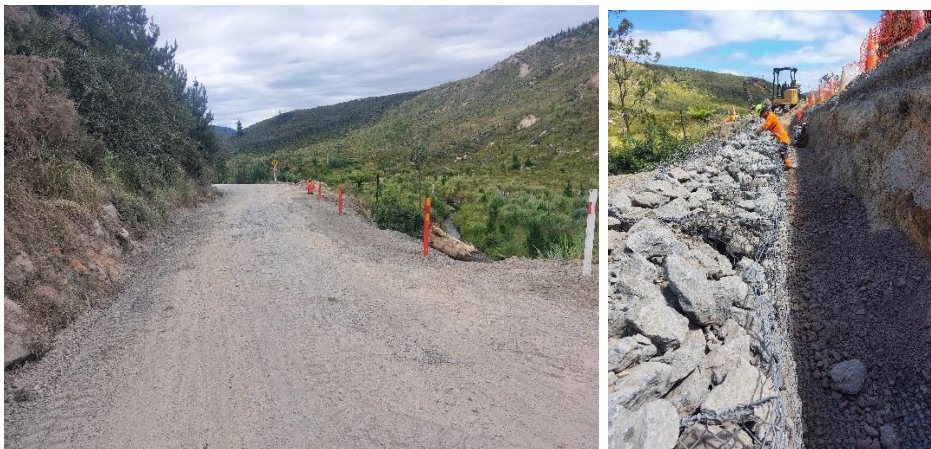
Pipiwai Rd Under slip repair