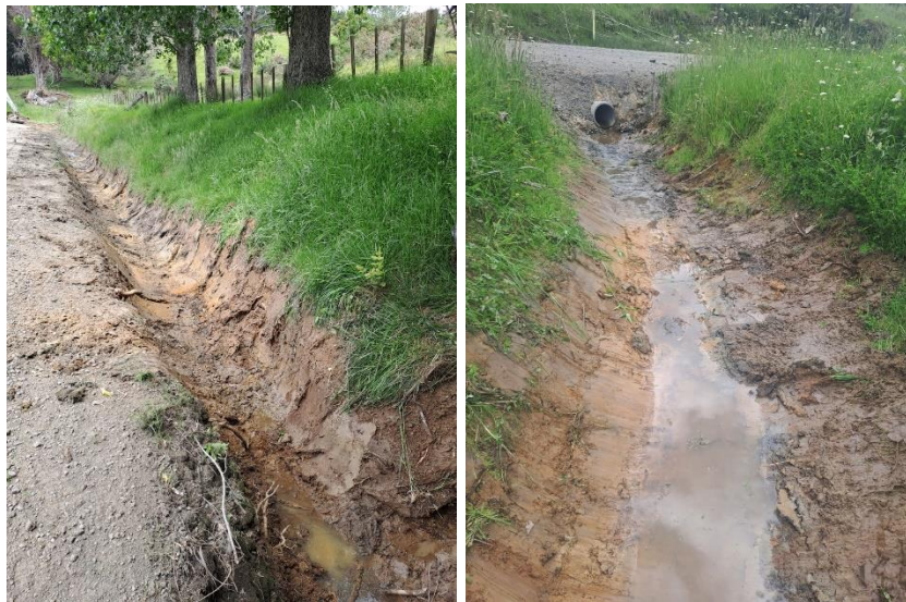
Drainage works Wharepunga Rd