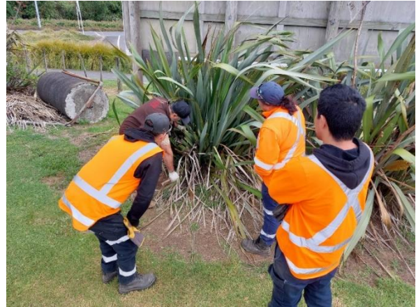
Flax cutting Heritage Bypass