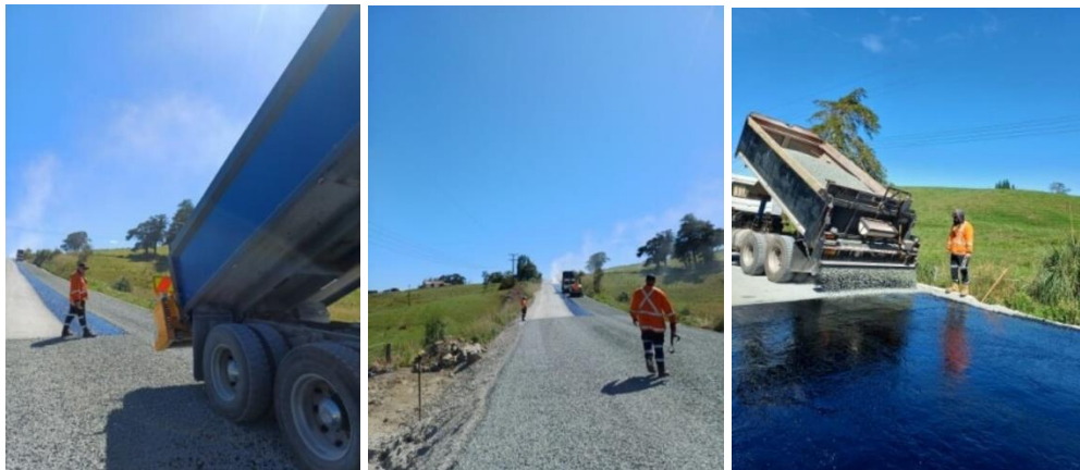
Paparoa Oakley Rd Sealing