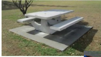
Concrete tables & seats Bird chairs & umbrellas for shade