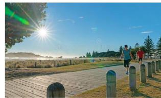
Bollards to keep vehicles off the grass and pedestrian safe