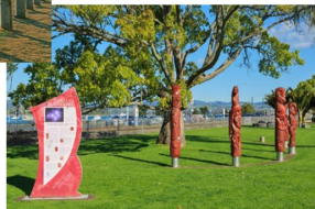
Welcoming park entrance signage