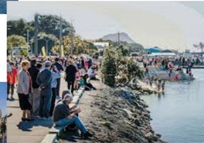
A low rock sea wall protects the concrete recreational space between the wharf and boat ramp. The top of the wall will have long planks creating informal seating and a low barrier