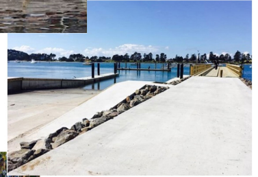
Concrete steps between the wharf and boat ramp. Large rocks separate the vehicles launching boats and the people using the space.