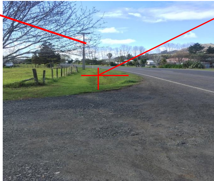
Te Rarawa Marae looking West towards Ahipara (Photo 2)

Note: Recommendation regarding potential for culvert/drainpipes to be placed and covered giving potential for limited off road parking outside the marae. Approximately 2m wide by 50 m long. This would compliment current on-site parking.