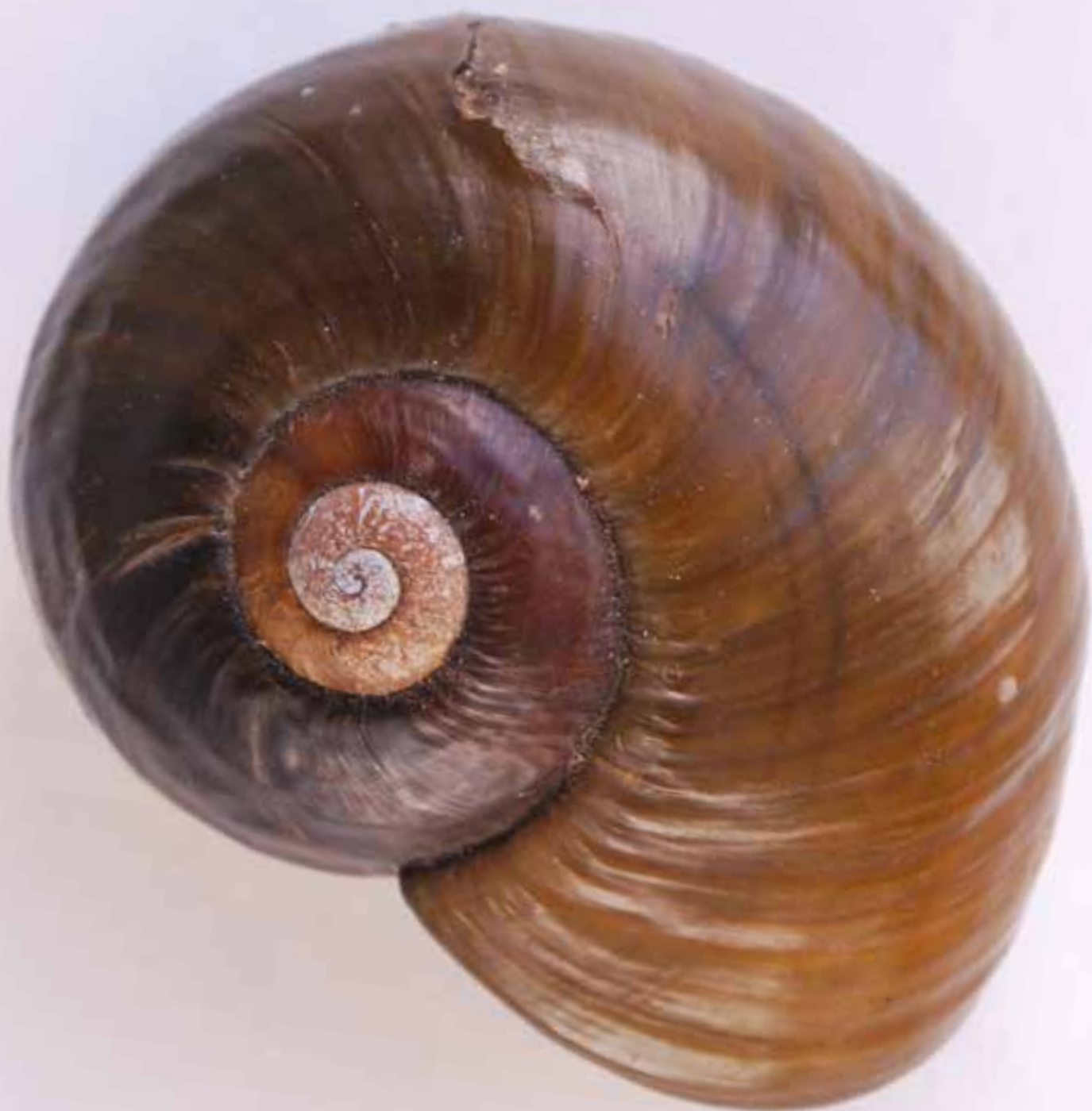
Pupu Rangi or Pupu Harakeke, the flax snail. Natural history collection. Museum at Te Ahu