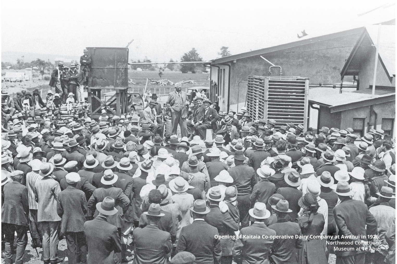
Opening of Kaitaia Co-operative Dairy Company at Awanui in 1926.

The following pages dive deeper into how we'll achieve each of these goals (our strategic objectives). Each year, we will develop an action plan to deliver on the objectives.