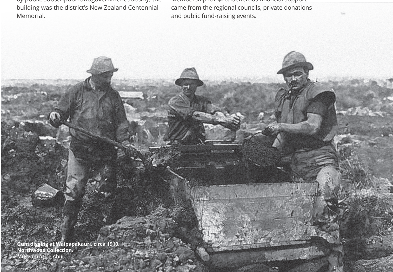
Gum digging at Waipapakauri, circa 1910.