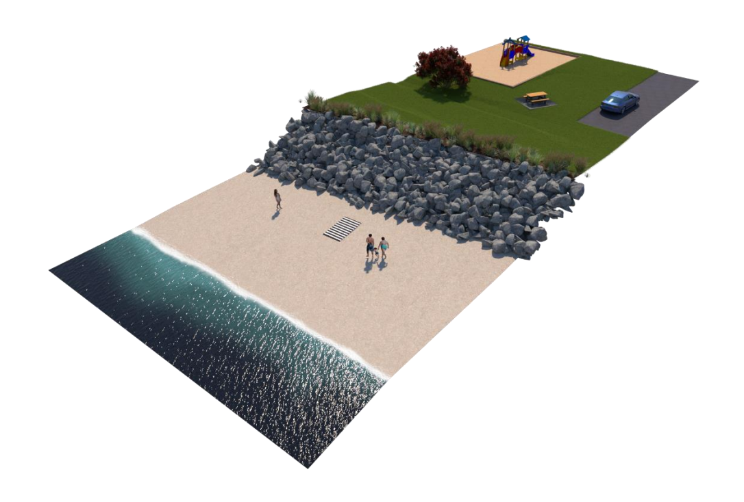
OPTION 1A – HIGH ROCK RIPRAP WALL