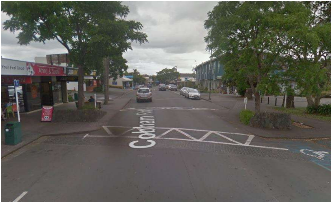
Figure 4: Cobham Road, crossing point on a raised platform with kerb extensions

Immediately east of the proposed bus stop is a crossing point on a raised platform with kerb extensions. (refer to Figure 4 ).