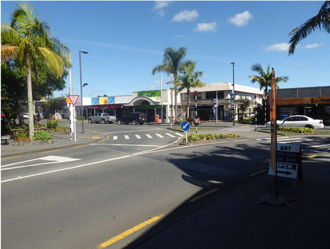
Figure 5 : Pedestrian Crossings on raised platforms at the intersection of Cobham Road and Kerikeri Road.