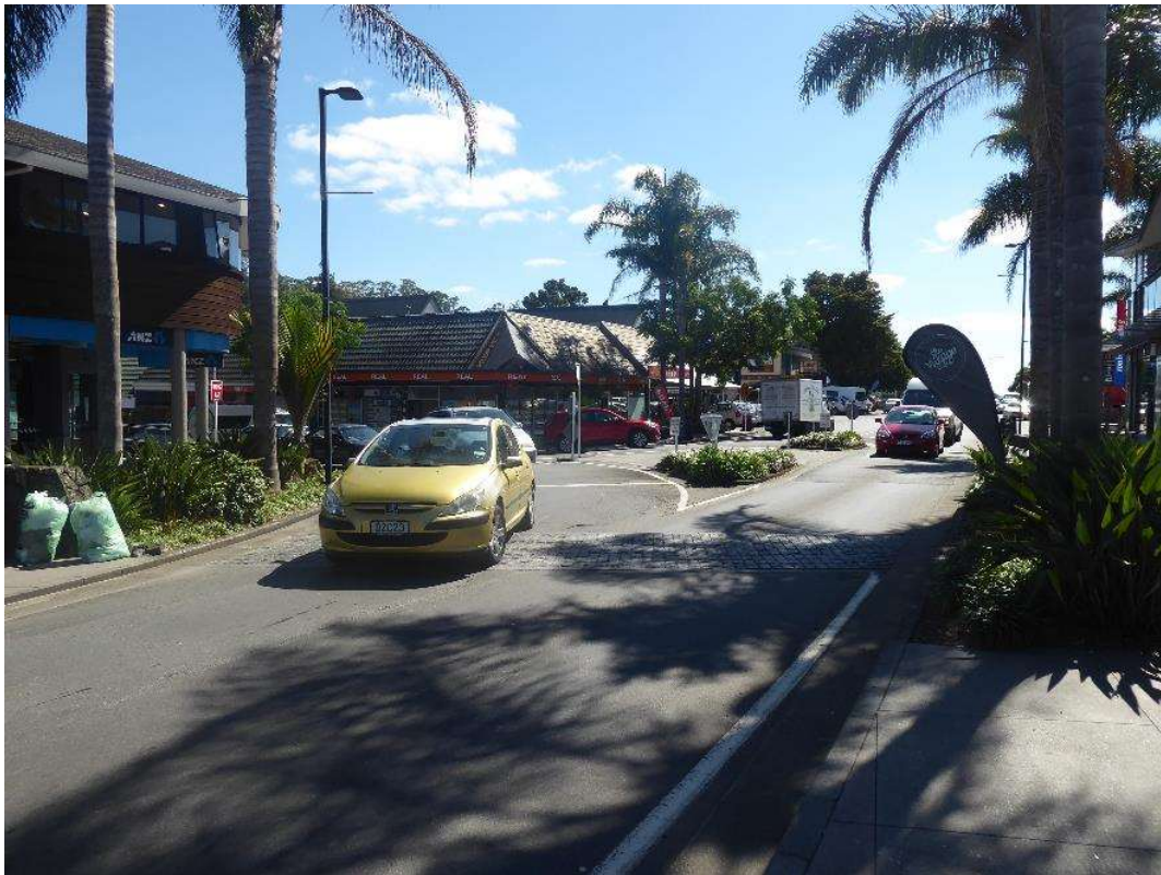
Figure 3 Traffic circulating on the existing one way system.

The auditors, therefore, consider that there are no safety implications of the use of the one-way system by a relatively small number of service buses. However, whilst not within the scope of this audit, the auditors consider that there are aspects of the one-way system, particularly the raised platforms that could be enhanced to improve road safety.