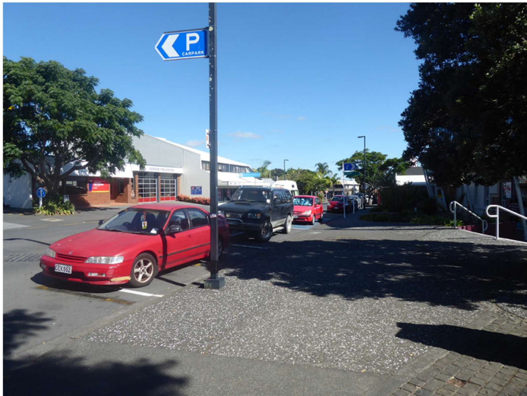
Figure 1: Location of proposed bus stop

When compared with the existing bus stop location, the proposed location is nearer the facilities on Kerikeri Road. The auditors consider that both location and the proposed layout is fit for the purpose. The proposed double length bus stop should eliminate the existing ‘double parking’ of buses that is currently occurring in the majority, if not all circumstances. The proposed location for the bus stop is shown in Figure 1 .