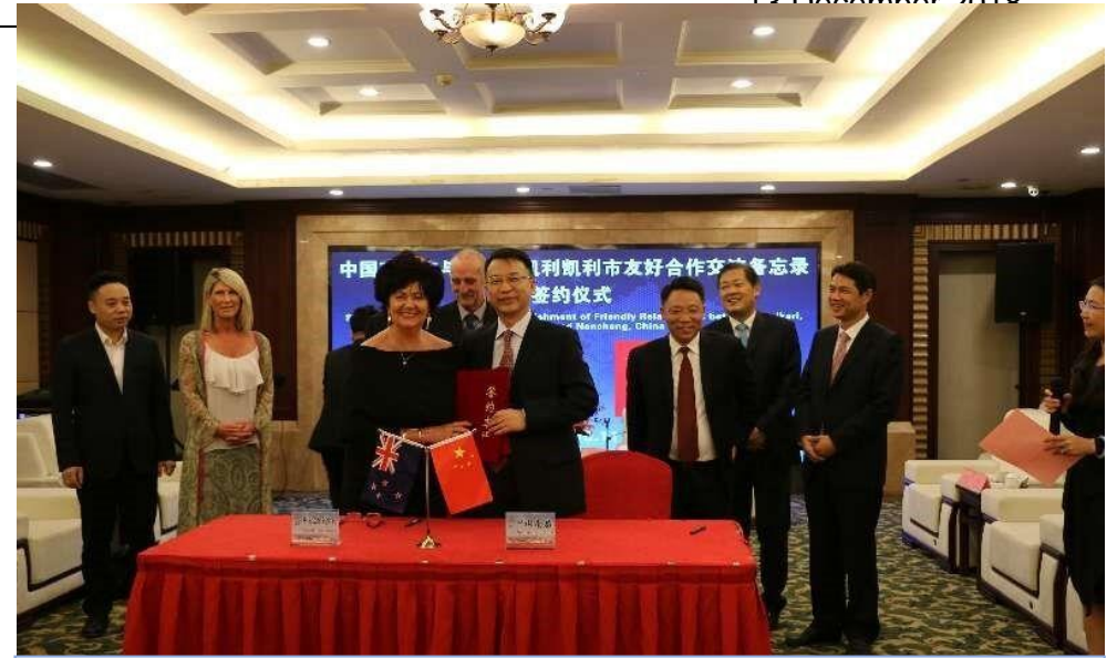
Nanchang Sister City Signing