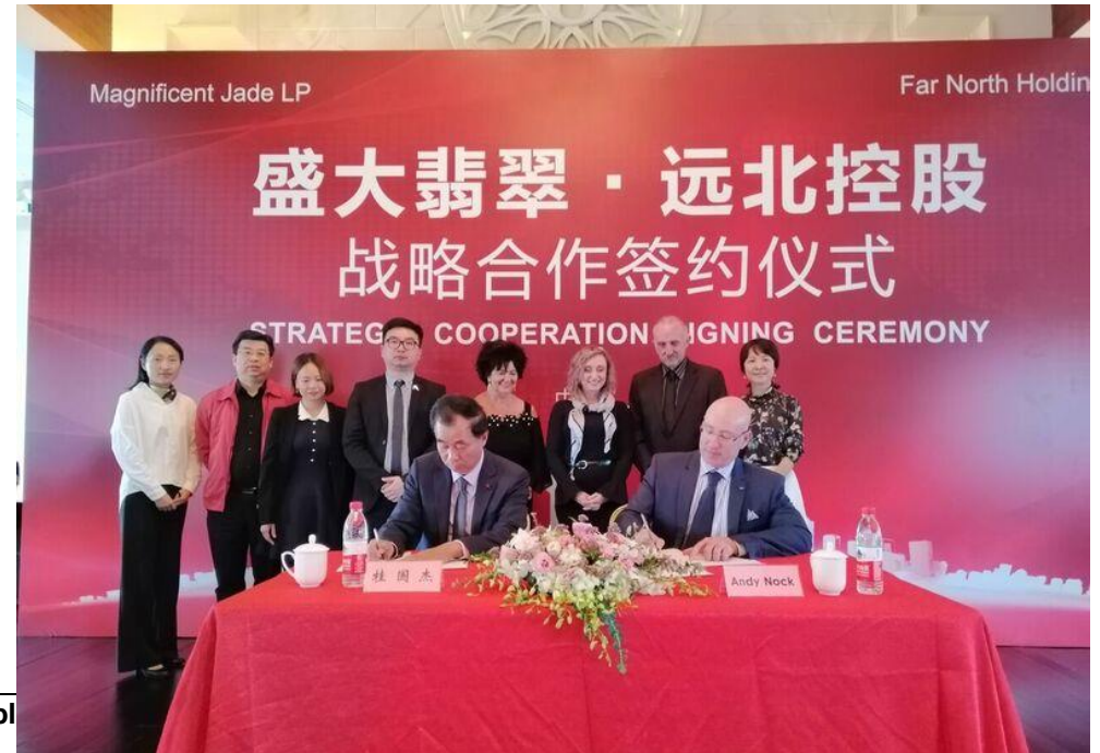
Shanghai CRED signing