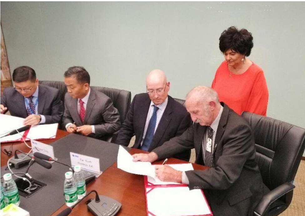
China Power signing