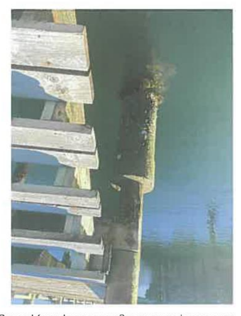
Wooden wharf at low tide showing wet loading platform stairway and wooden piles. Club volunteers have attempted to strengthen rotten pile by pouring concrete around it.