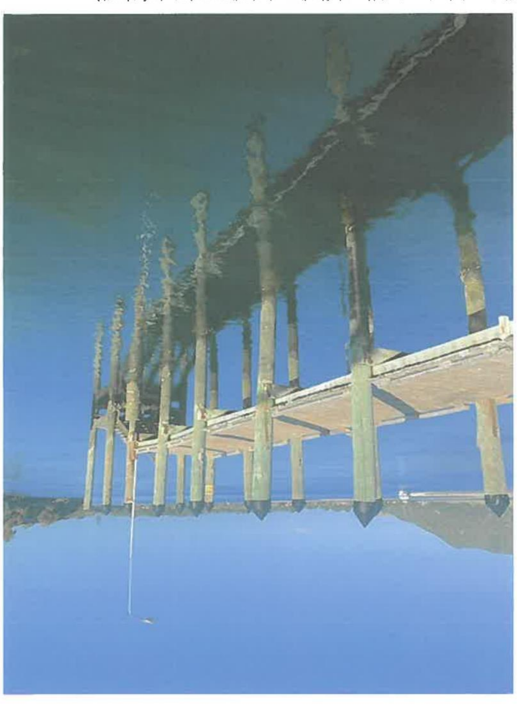
Photograph showing potential hazard of loading and unloading vessels at wharf at low tide.