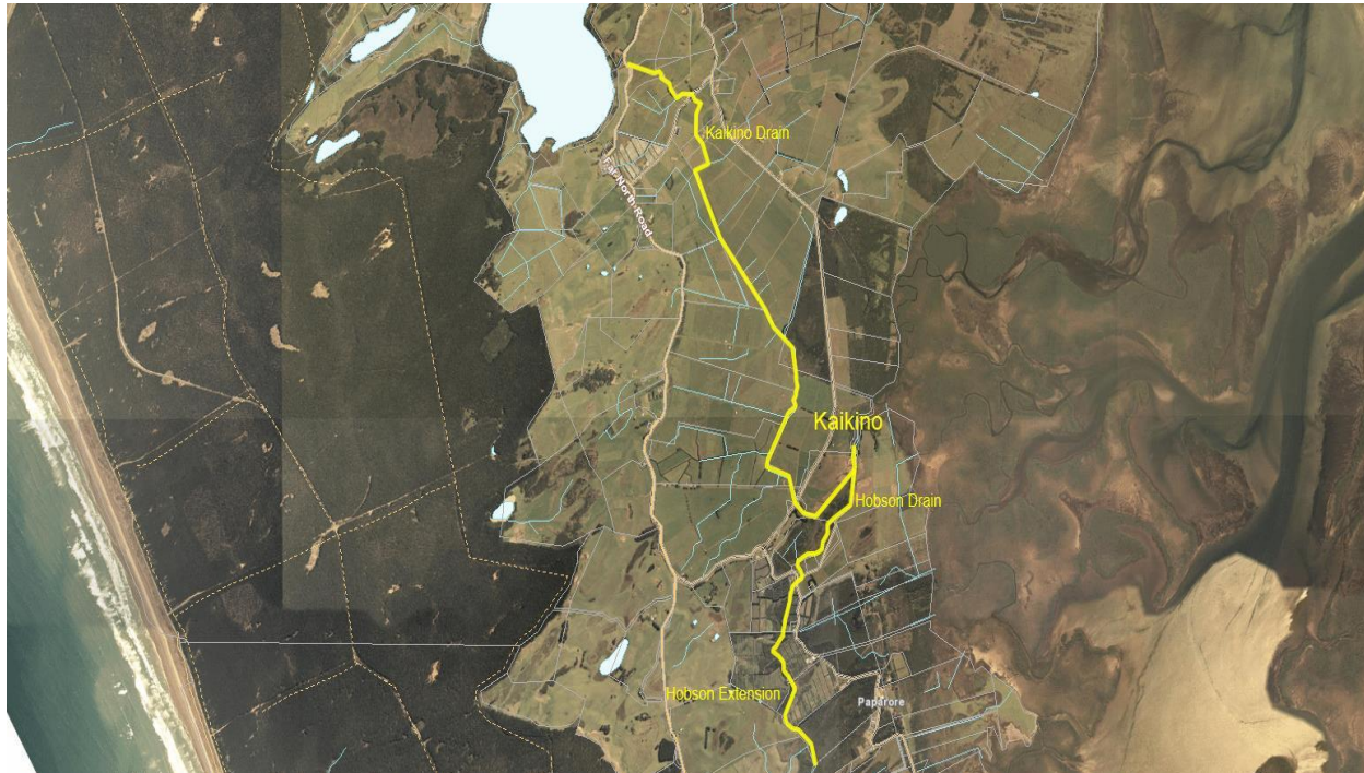
Figure 2 – Map Index for the Kaikino Area (Aerial)