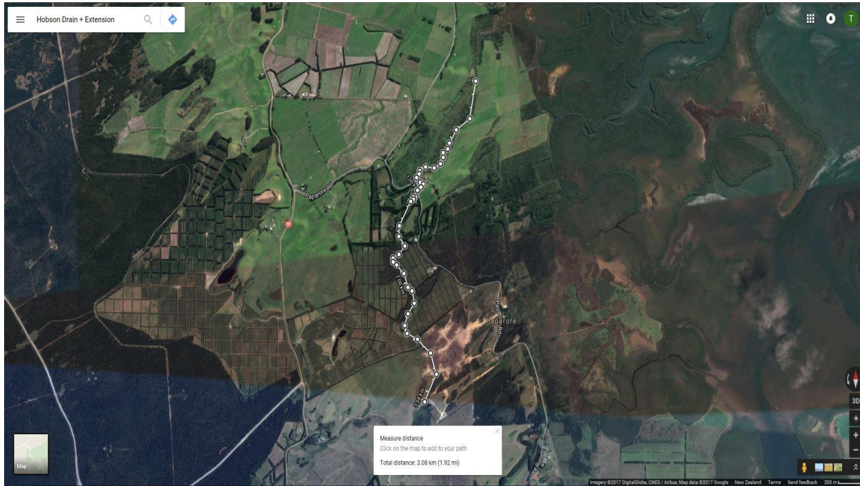
Figure 5 – Location and Length of the Hobson Drain + Extension (Google Maps)