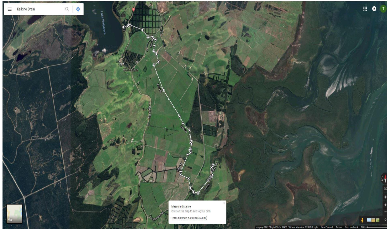
Figure 4 – Location and Length of the Kaikino Drain (Google Maps)