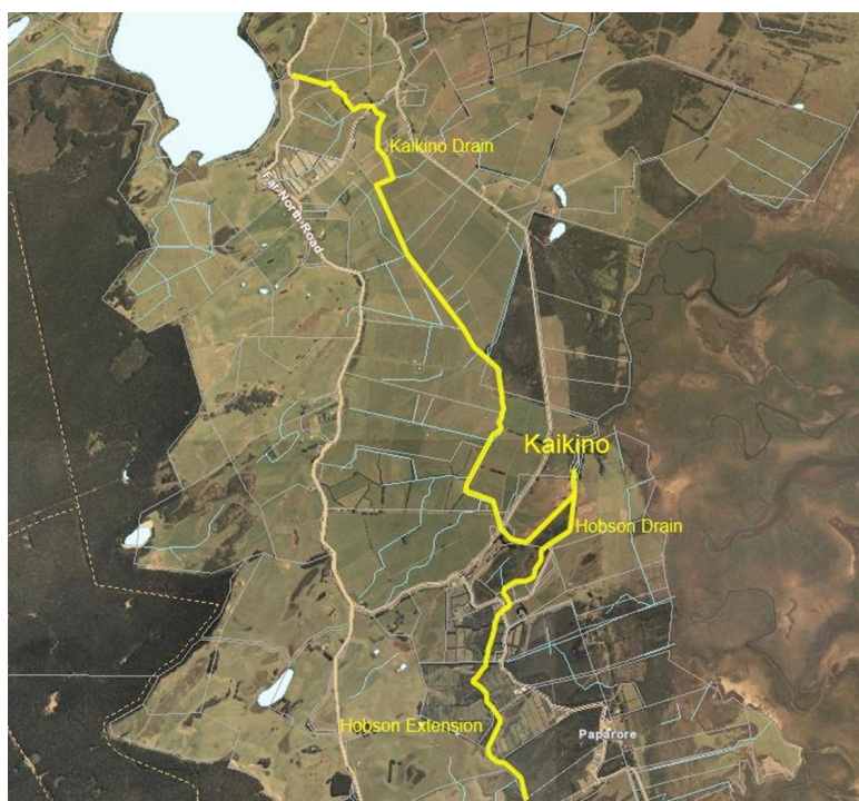
Figure 1 – Map Index for the Kaikino Drainage Area

Recently, the management of these Drainage Areas was split between the FNDC (generally farm drainage) and NRC (rivers and main tidal flows) to maintain the standard/quality of land and drainage. The FNDC liaise with, and obtain advice from the relevant Drainage Committees.