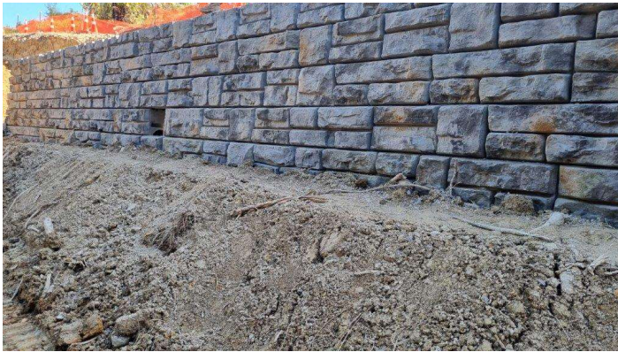
Whangae Road wall completed