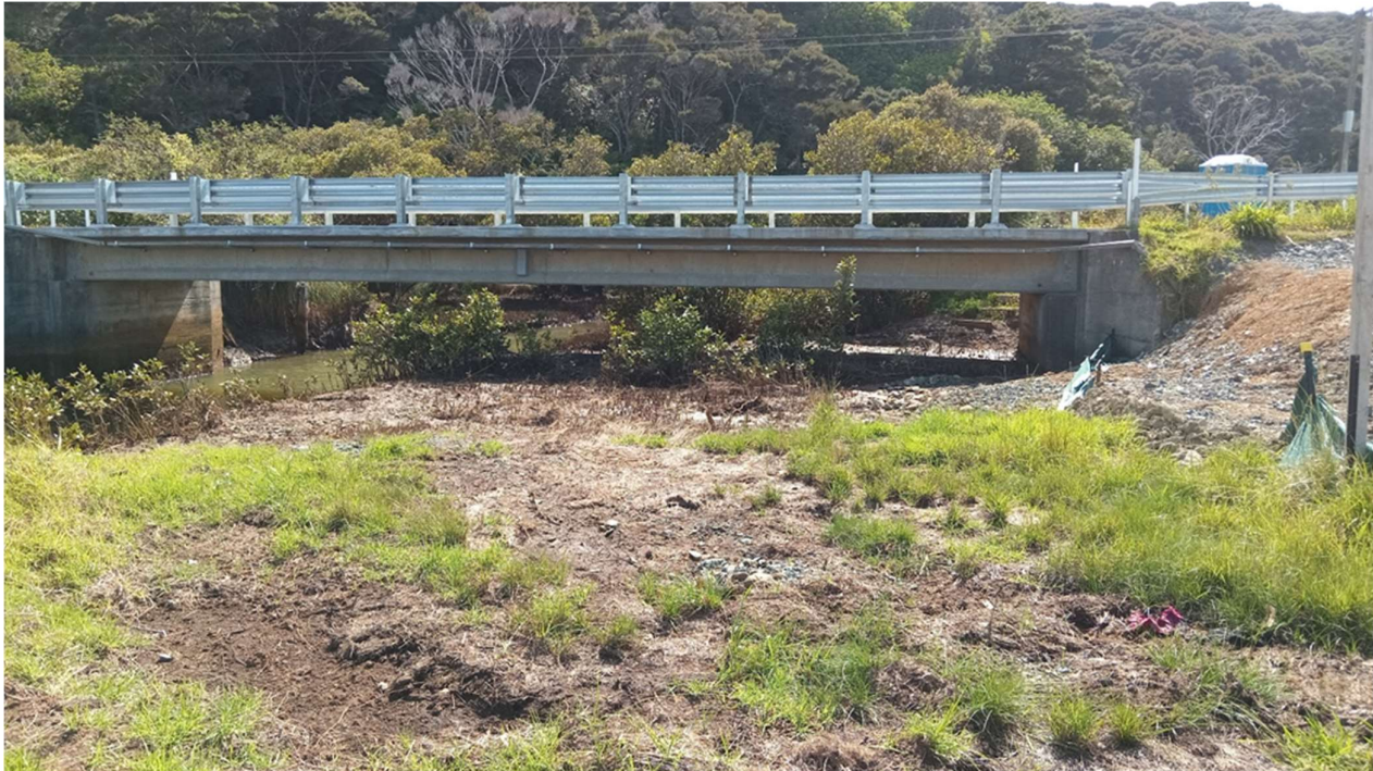
Photo Hihi Bridge Completion