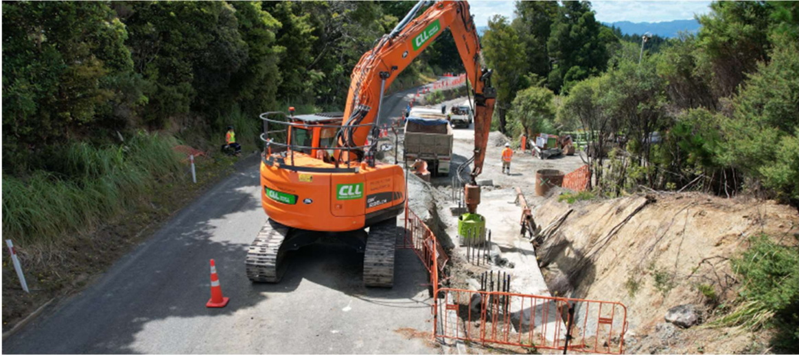
West Coast Road Construction