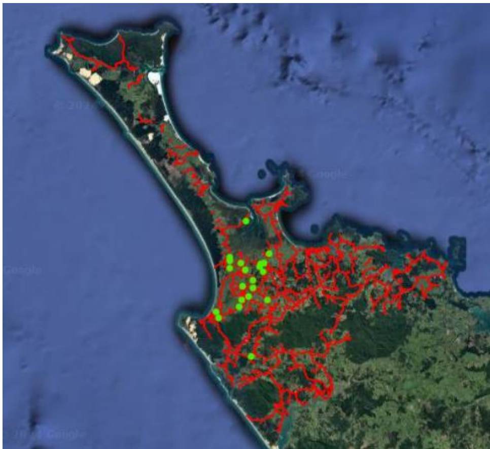
Figure 4: Locations of roadside mowing completed (highlighted green)