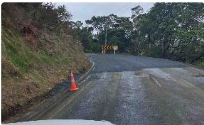
Pre reseal repairs – Whangaroa Road