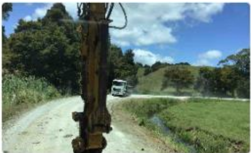
Water tabling in progress – Mangatoetoe Road