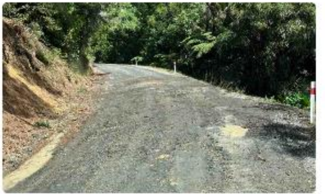
Holiday call out to Fallen Tree on Duncans Road