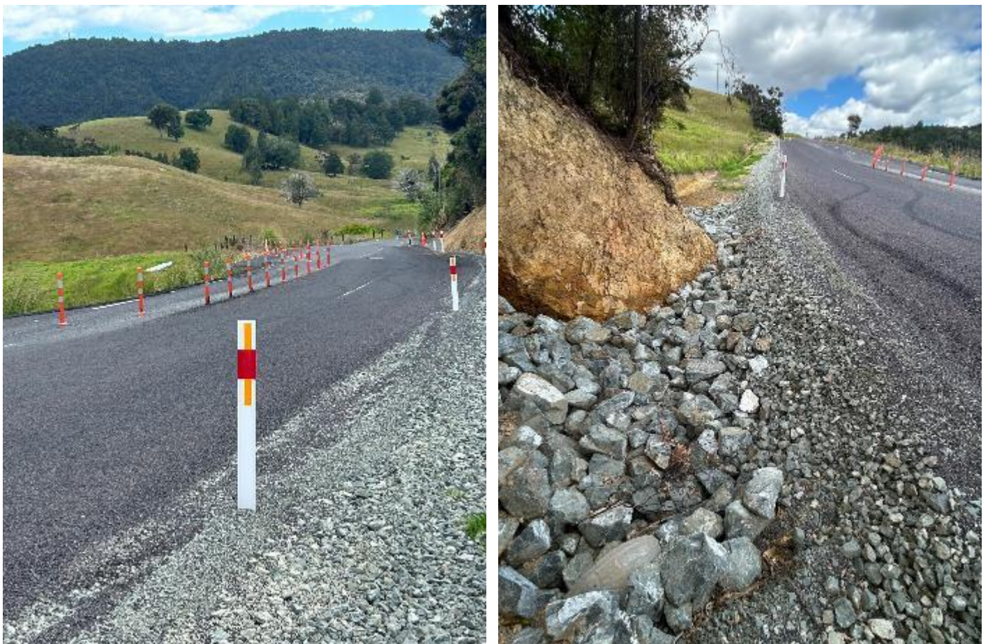
Figure 1: Completed retreat around Wainui Rd Slip

Below are photos of the Wainui Rd Slip Retreat. The cover photo is of recently completed metalling of Spirits Bay Rd.