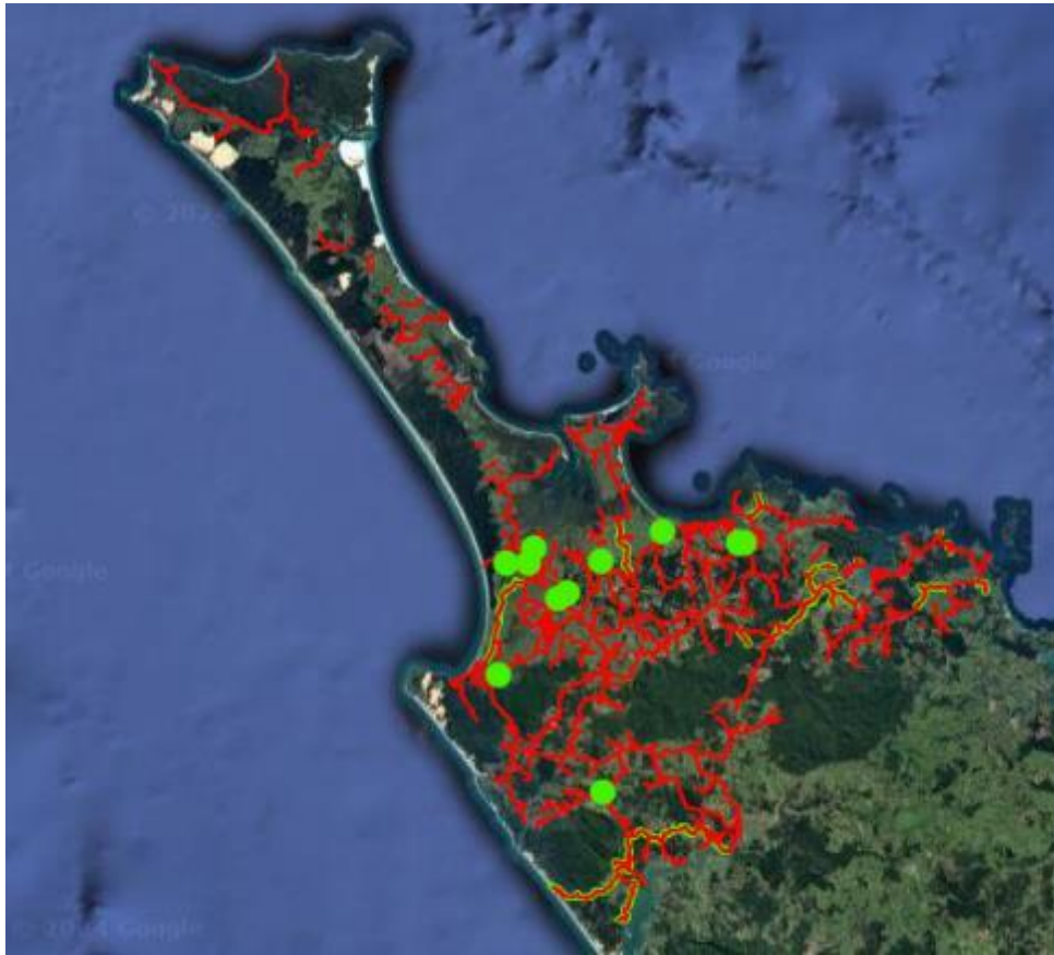
Figure 3: Locations of grading completed (highlighted green)