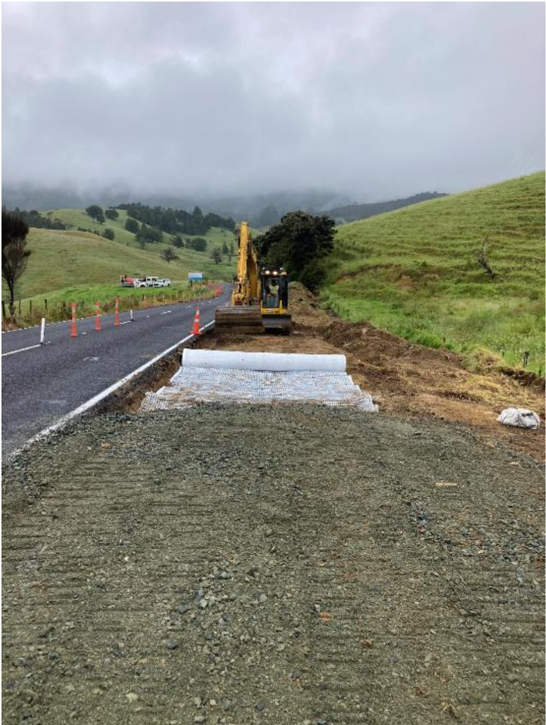
Wainui Rd Slip Repair Retreat in Progress