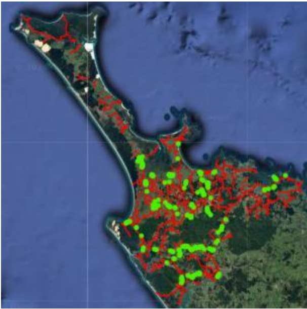
Figure 2: Locations of potholing completed