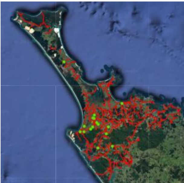
Figure 4: Locations of roadside mowing completed