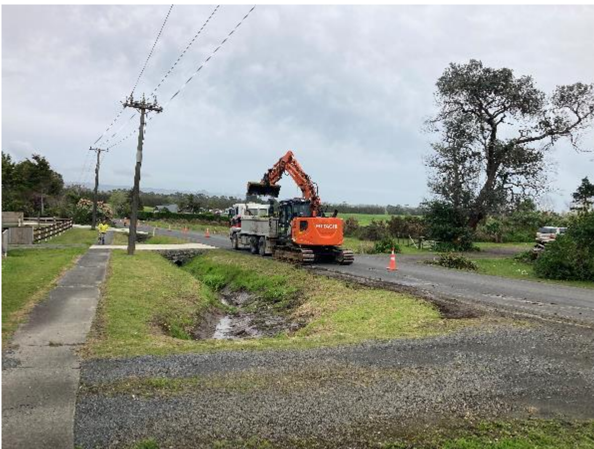
Figure 1: Drainage improvements on Kaitaia Awaroa Rd in preparation for an upcoming reseal

Below is a photo of Jecentho Contracting Excavator Operator Roger Frear completing culvert clearing, water tabling and high shoulder removal on Kaitaia Awaroa Rd. The cover photo is of pavement stabilisation on the Ruaroa Rd Seal Extension.