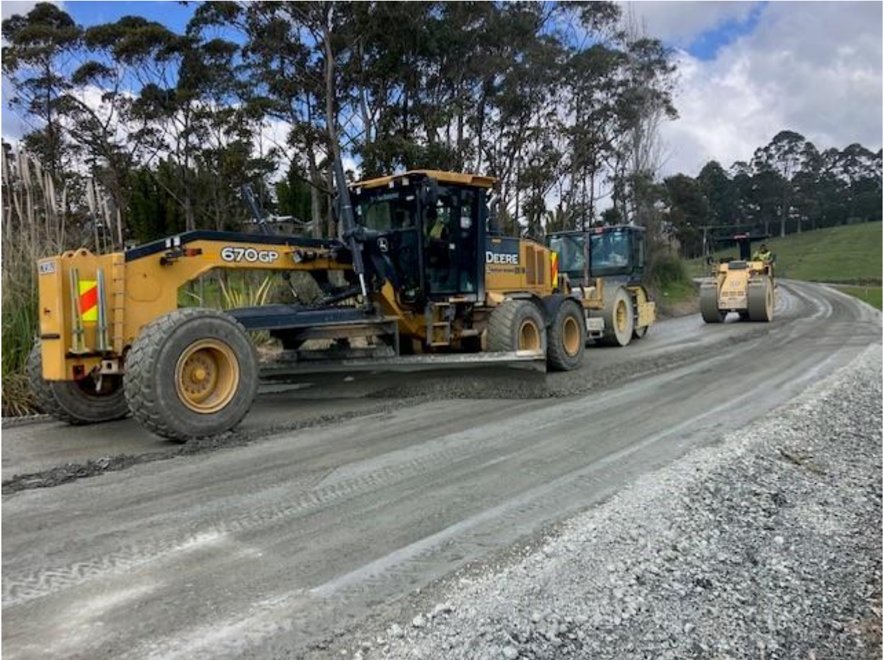
Pavement seal preparation in action on the Ruaroa Road Seal Extension. This is our first renewal project completed for the season, with 900m of new seal completed.