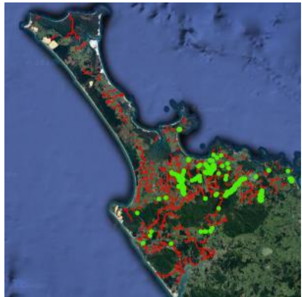
Figure 5: Location of culvert clears completed