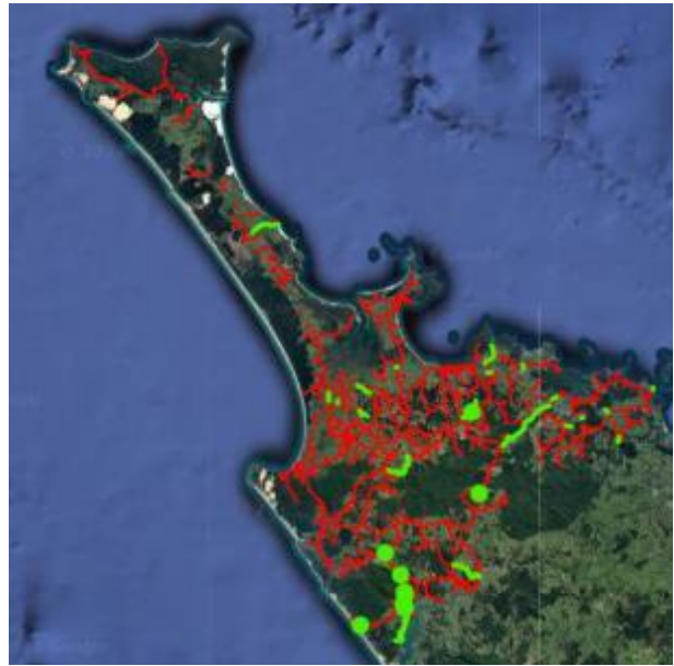
Figure 3: Locations of grading completed