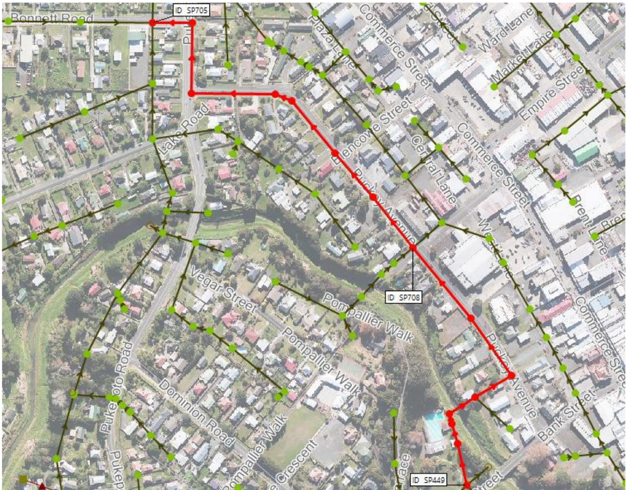
Figure 1-1: Proposed works for stage one of construction.