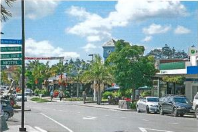
KERIKERI LOOKING EAST