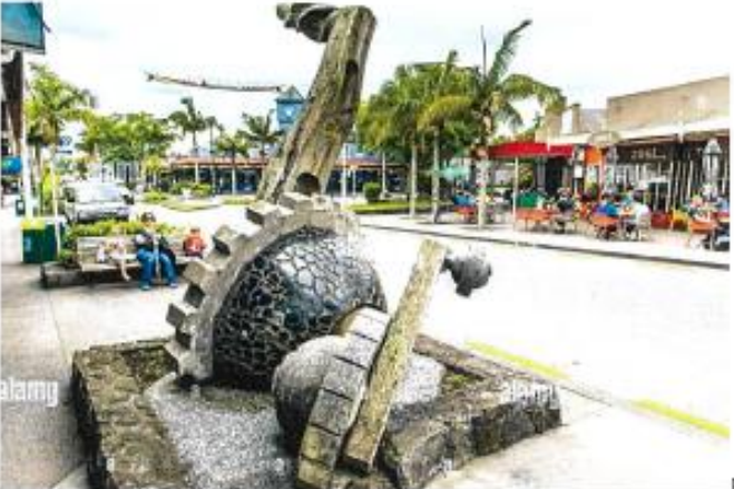
KERIKERI LOOKING EAST