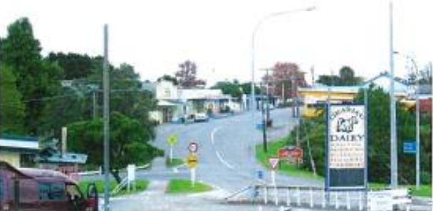
OKAIHAU LOOKING WEST