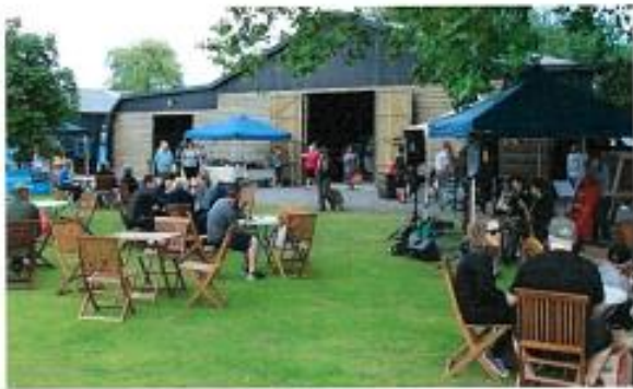
CLAUDELANDS MARMERS MARKET