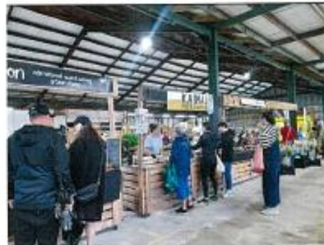
CLAUDELANDS FARMERS MARKET