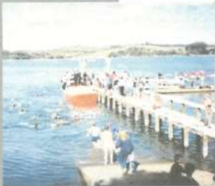
Jetty opening day & mid winter Dip 21 June 1992