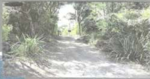
Track through Rangitane Scenic Reserve

Blacksmiths Bay has a white sandy beach and native pohutukawa trees down to the water's edge and is accessible by water craft. Its sheltered location makes it a great canoeing area on the high tide. The beach is part of the Rangitane Scenic Reserve.