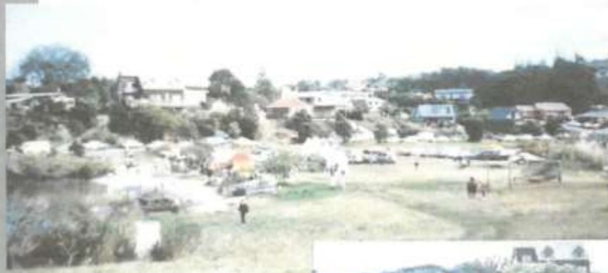
Community Events on the Rangitane Reserve

"The Rangitane Waterfront and Recreation Reserve are the HUB and gathering place for the wider community"