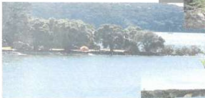
Aroha Is. - Camping