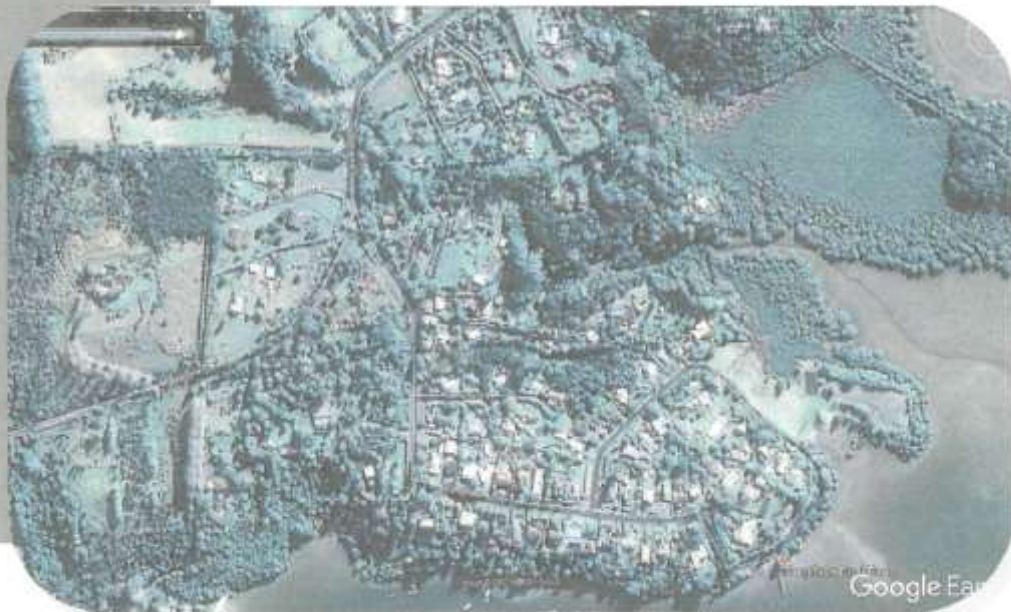
dated 1 July 2020

Draft Kerikeri Peninsula Community Development Plan - RANGITANE