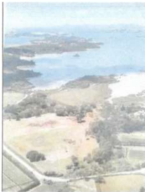
1990 Derek Gibson's property ( view looking over number 219 Rangitane Rd, Aroha Is, Blacksmiths Bay to end of peninsular)