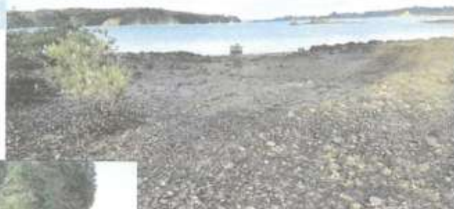
Aroha Is. - Boat Ramp