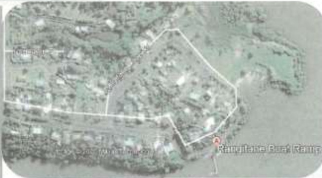
dated 23 May 2003

"Kerikeri has 42% of total growth in the Far North" FNDC Figures 2018