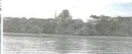
Blacksmiths Bay Beach

Draft Karitane Peninsula Community Development Plan - RANGITANE