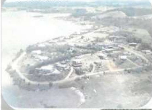
Pic dated early 1980's

Rangitane has a waterfront position and sits on the Northern edge of the Kerikeri Inlet half way along the Kerikeri Peninsular and provides access to the Kerikeri Inlet. Map Coordinates 35° 12' Latitude, 174° 00' Longitude. The Post code for Rangitane is 0294. There are over 300 houses in the catchment and growing.