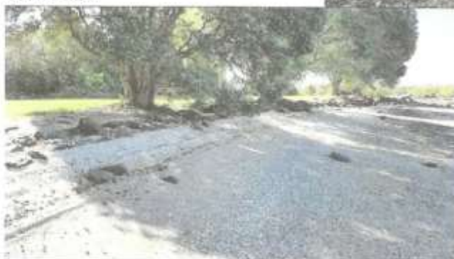
Aroha Is. - Beach