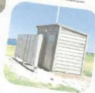
Examples of composting toilets.