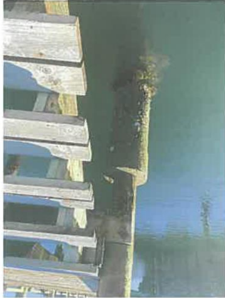
Wooden wharf at low tide showing wet loading platform stairway and wooden piles. Club volunteers have attempted to strengthen rotten pile by pouring concrete around it.